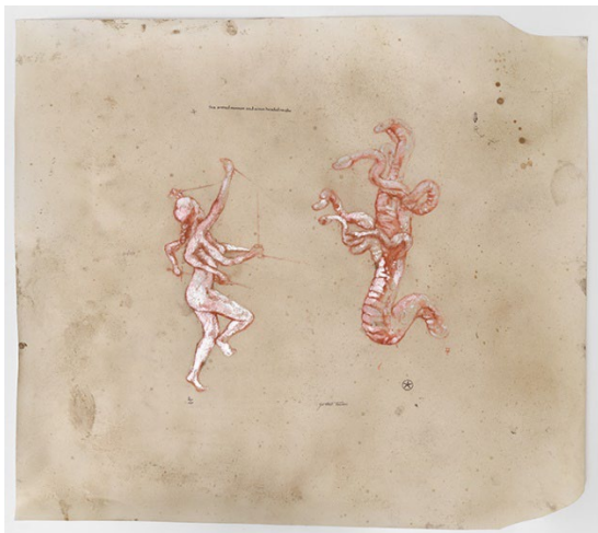
Damien Hirst Kali Confronts Hydra, 2015 Pencil, ink and silver leaf on vellum 59 × 72 cm