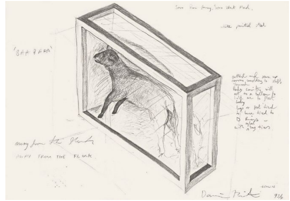
Damien Hirst Away from the Flock, 1994 Pencil on paper 50 × 73 cm Photographed by Stephen White © Damien Hirst and Science Ltd. All rights reserved/ Bildrecht, Vienna 2025