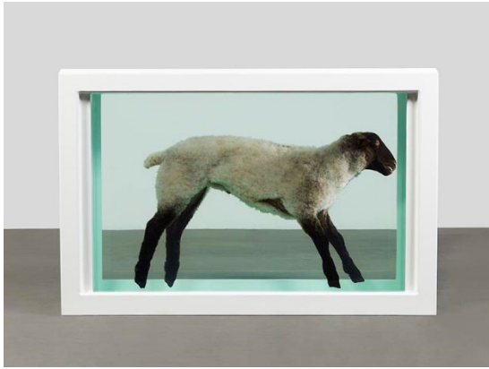
Damien Hirst Away from the Flock, 1994 Glass, painted steel, silicone, acrylic, plastic cable ties, lamb, and formaldehyde solution 96 × 149 × 51 cm Photographed by Prudence Cuming Associates Ltd © Damien Hirst and Science Ltd. All rights reserved/ Bildrecht, Vienna 2025