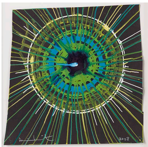
Damien Hirst Beautiful That's No Immaculate Conception Drawing, 2008 Ink on paper 31 × 21 cm © Damien Hirst and Science Ltd. All rights reserved, Bildrecht, Vienna 2025