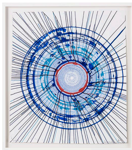
Damien Hirst Beautiful Temporarily Lost At Sea Drawing, 2008 Pastel and ink on paper 47 × 42 cm