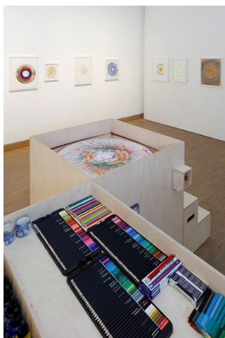
Installation view, Damien Hirst: Drawings at Albertina Modern, Vienna, 7 May - 12 October 2025. Photographed by Rainer Iglar. © Damien Hirst and Science Ltd. All rights reserved, DACS 2025.

The following images are available free of charge in the Press section of www.albertina.at . Legal notice: The images may only be used in connection with reporting on the exhibition.