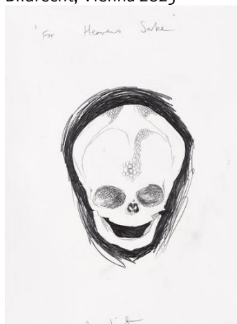
Damien Hirst For Heaven's Sake Drawing I, 2008 Pencil on paper 76 × 56 cm